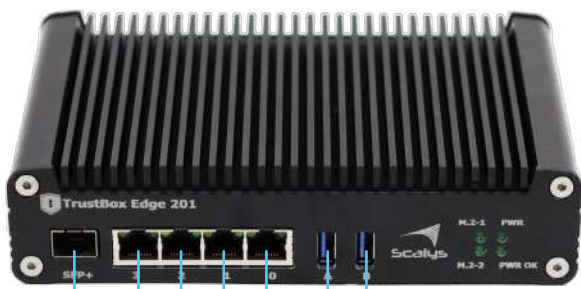
SFP + Port 4x 1Gb Ethernet 2x USB 3.0